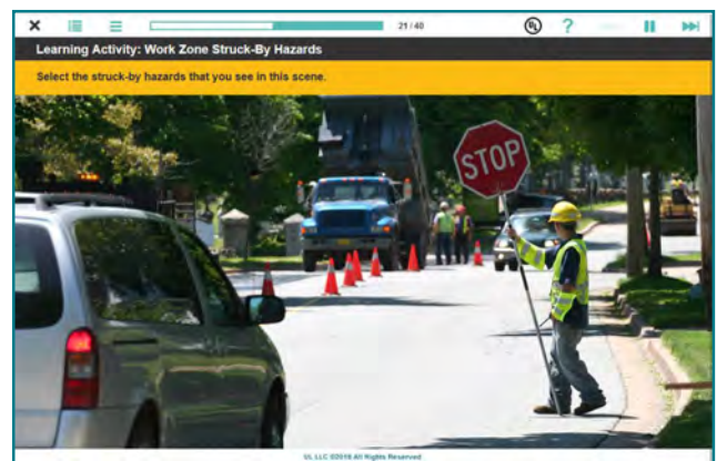
All courses include intuitive navigation, high-resolution graphics and up-to-date information to create the ultimate learning experience.